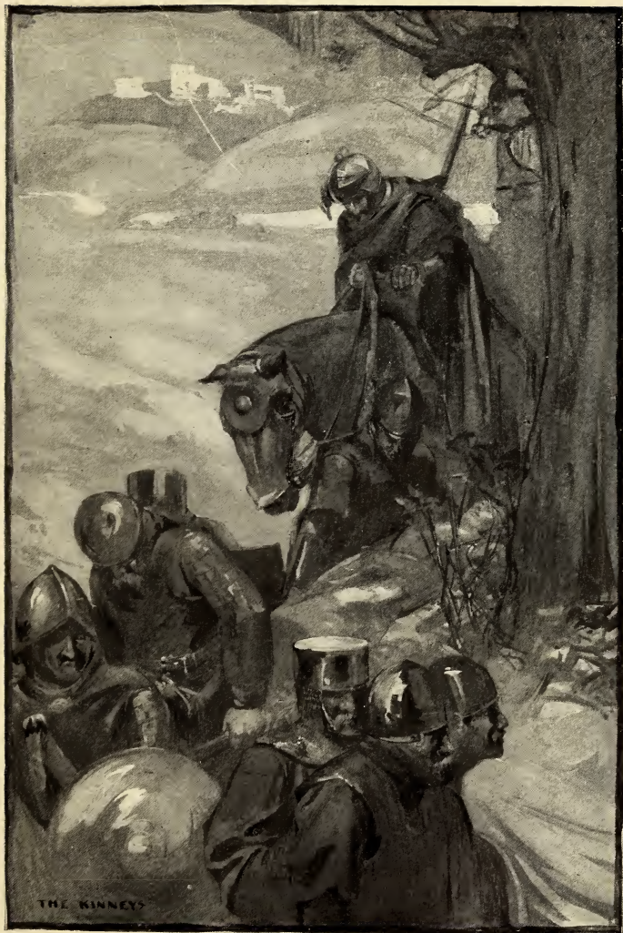
ALL WEARY, ALL WOUNDED, AND ALL WITH BURNING HEARTS